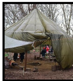
New Forest School Parachute