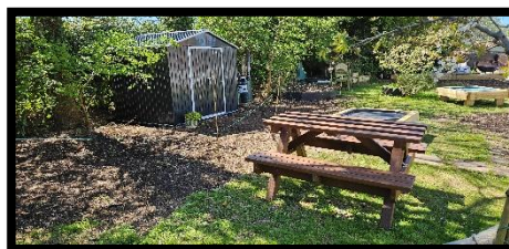
Y1 and Y2 Learning Garden redevelopment