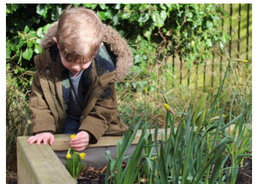
Our fantastic preschool 2, 3 & 4 year olds