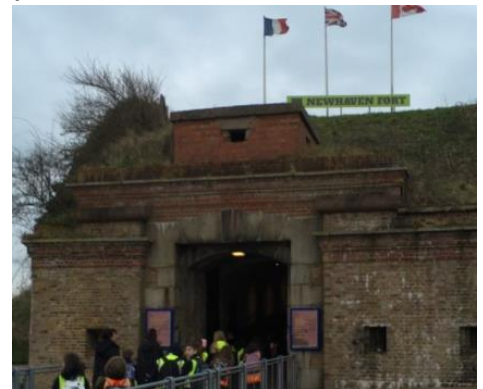
Year 6 visiting Newhaven Fort