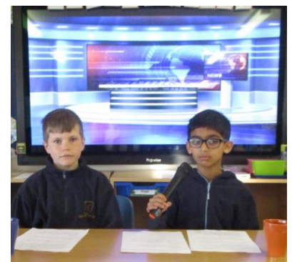
Mandela class - hosting a news report!