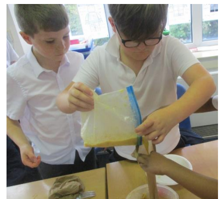
Learning the digestive system