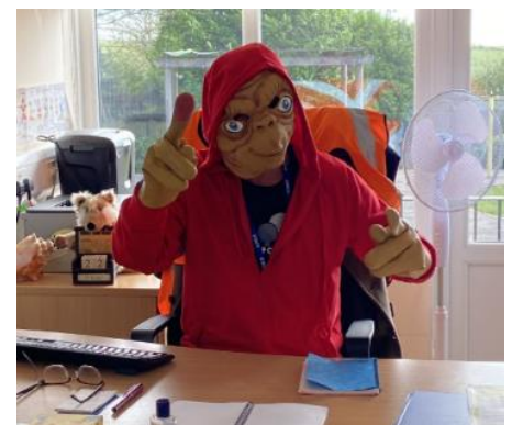
ET running the school on Spooky Day!