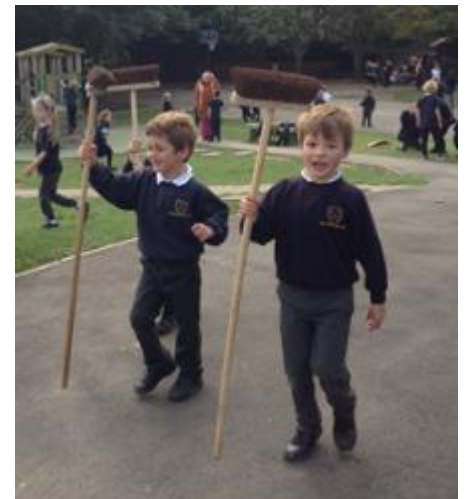
Opal play at lunch time